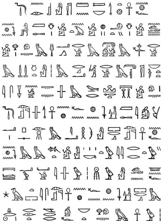
STELE OF ANKH-F-N-KHONSU.