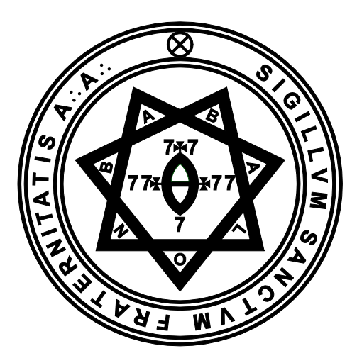
A::A:: Publication in Class A